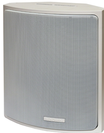
NQ-S1810WT Wall Baffle VoIP Speaker