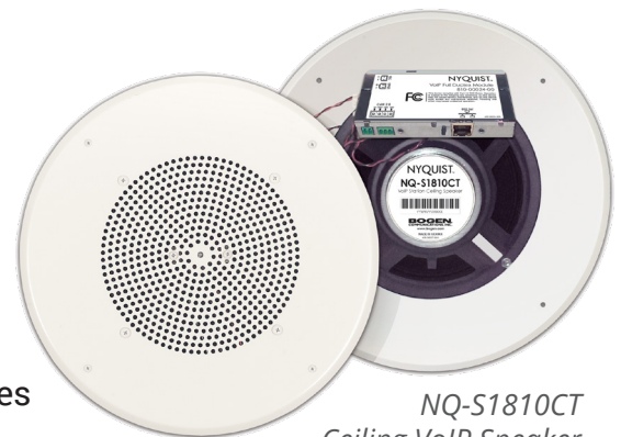
NQ-S1810CT Ceiling VoIP Speaker